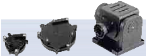
2 - size Rotary For Inner & Outer Stamping