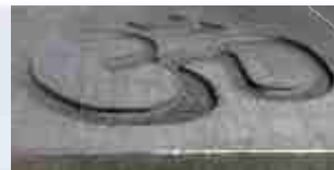
1mm deep engraving