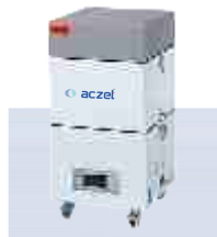
Professional Dust Collector