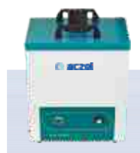
Basic Dust Collector