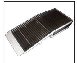
Roller & Ramp