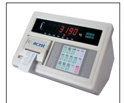
Built in Printer Indicator