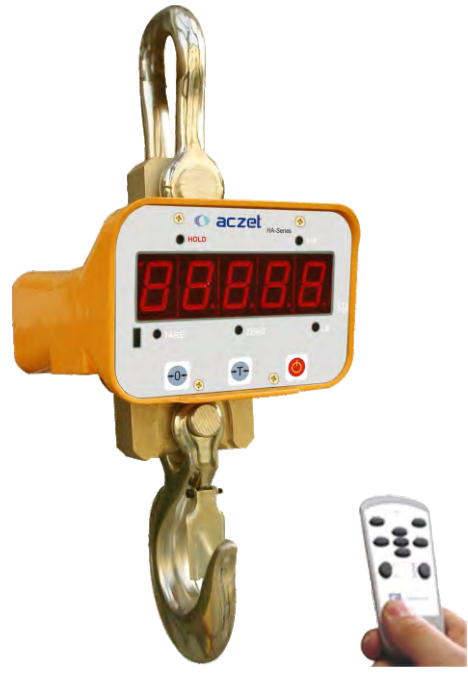
1 T to 5 T