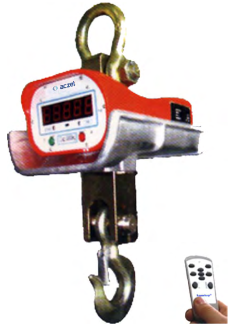
Anti Heat Shield