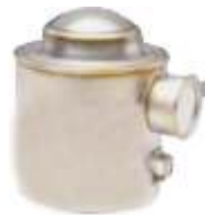
Digital Compression Load Cell